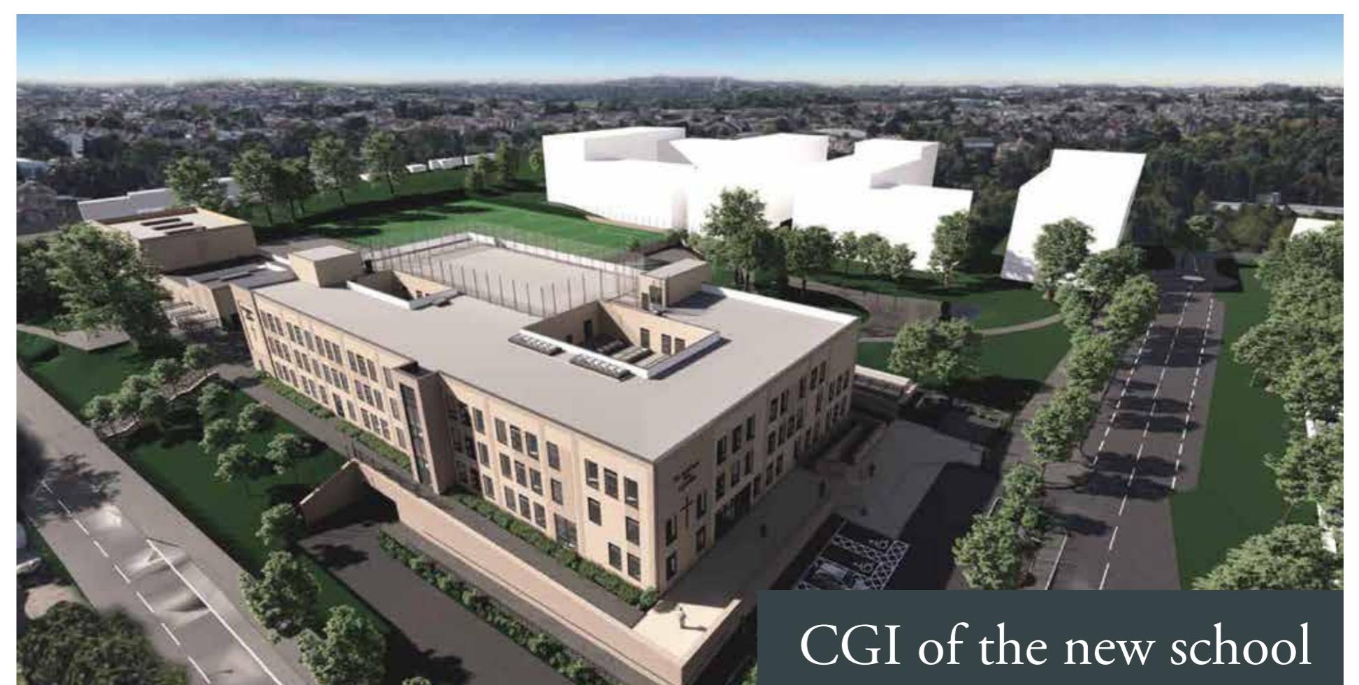
CGI of the new school

A large space on the site will be allocated for new sports fields primarily for after school activities but it will also be accessible for both new and existing residents. Included in this space will be new sports pitches as well as further open areas suitable for a variety of activities.