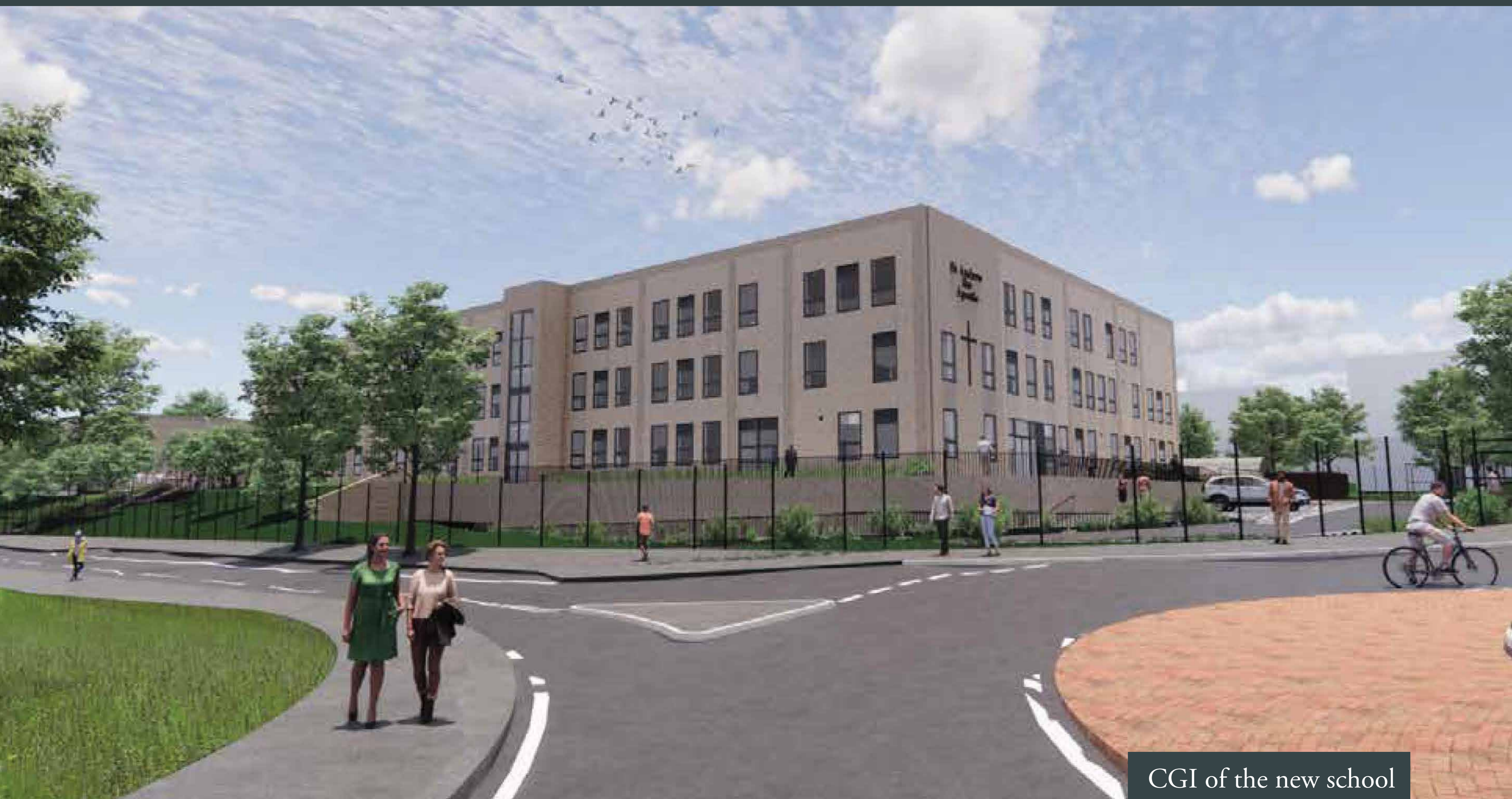
CGI of the new school

Given the scale of the development, a priority when developing these plans was to give something back to the community. The plans will deliver new school facilities for St Andrew the Apostle School and new outdoor sports fields. These will help provide for both new and existing residents and all are welcome to use these facilities.